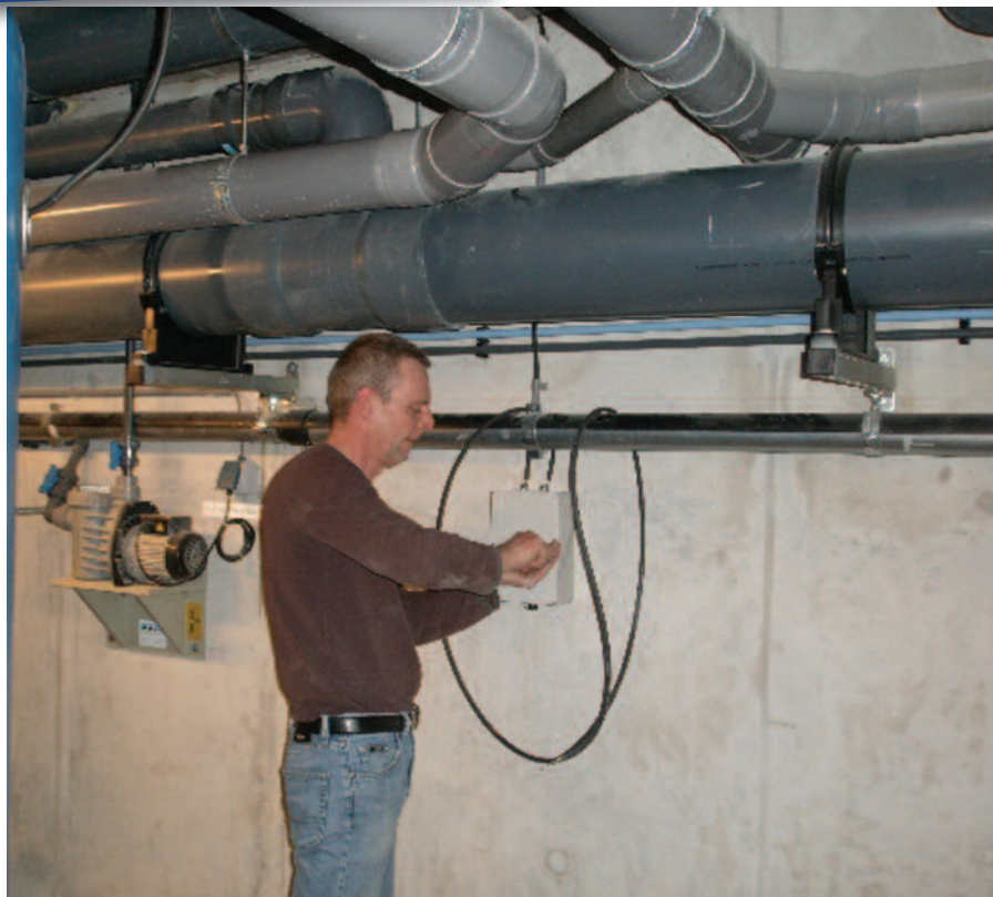
Fig. 1. Installation of an intelligent cathodic protection system in a stainless sand bed filter.