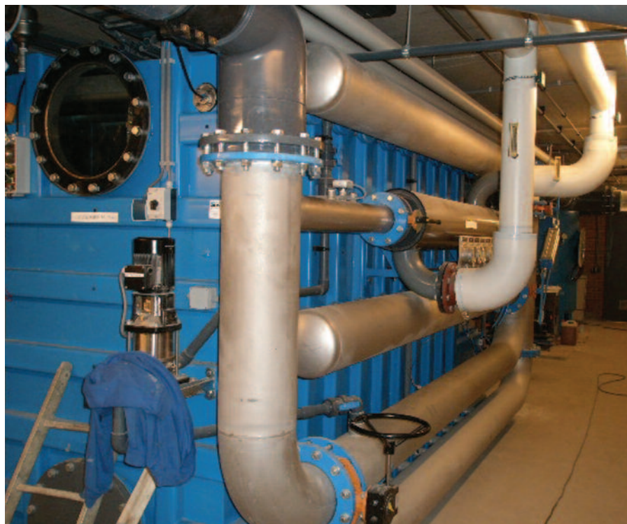
Fig. 3. Stainless steel sand bed filters used for cleaning swimming pool water are also protected using intelligent cathodic protection (photo by Innomet B.V.).

At present, thousands of intelligent anodes have already been successfully used in the protection of duplex stainless steel as well as to protect austenitic, ferritic and martensitic stainless steel. As there is no risk of over protection, hydrogen embrittlement cannot occur, which is often the case with conventional methods. Even when cathodic protection methods are used on steel constructions at sea, such as steel caissons with seawater lift pumps made of bronze or stainless steel, care must be taken to avoid over protection as undesirable hydrogen development can ultimately cause nearby duplex welds to