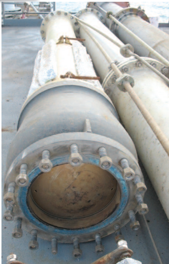
Fig. 6. Cast duplex stainless steel pump flange connected to duplex SS riser. Sacrificial anodes connected to the duplex stainless steel riser.

Fig. 5 shows a seawater lift pump manufactured from duplex stainless steel. The pump is fitted with a riser and the whole ensemble hangs in a steel tube. Aluminium anodes were attached to protect the entire system but it was subject to over protection when idle causing the development of an excessive amount of hydrogen at the cathode. This resulted in the formation of cracks in the duplex welded joints. Intelligent anodes do not cause these problems at all. In other words, galvanic corrosion is also controlled here, since there is a relatively large potential difference between carbon steel and duplex stainless steel. Moreover, this type of protection system also uses a so-called reference electrode. When this electrode acts as a sensor, the electronics maintain the potential at an ideal level under all conditions, without loss of power or capacity of the anode. If a variable system needs to be protected, such as a ship that sails in both freshwater and seawater, magnesium anodes are chosen as the conductivity of river water is relatively low. Normally, this type of anode would get out of control in seawater as magnesium is such a base metal. This