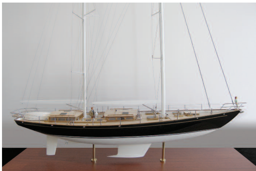
Fig. 7. The hull of this yacht is made from duplex stainless steel 1.4462 and fitted with intelligent anodes.

Thanks must go to the company Corrodium B.V., The Netherlands, for providing relevant information.