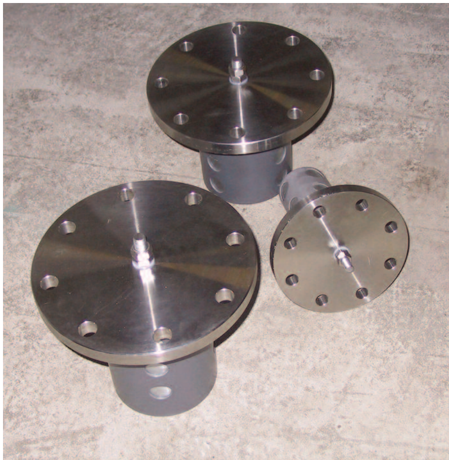
Fig. 4. Corrodium anodes with a stainless steel flange, used for seawater coolers etc. The electronic circuits are built in, eliminating the need for a separate housing or cables.

crack. The same applies to undersea duplex pipes which can be subject to excessive negative polarisation due to the protection system of the steel platform. All these problems are completely eliminated if intelligent or self-switching anodes are used. In addition, there is no risk of under protection, which in turn can also lead to undesirable corrosion.