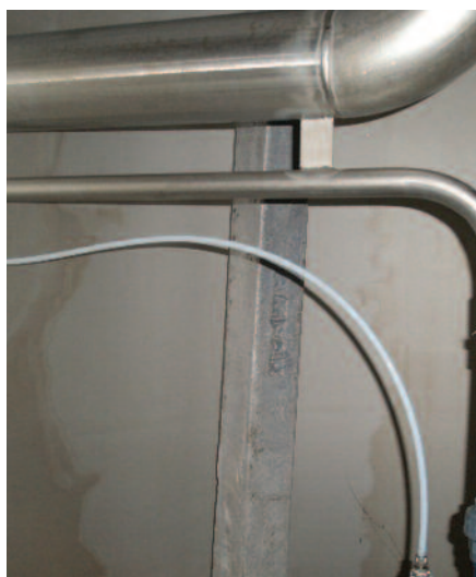
Fig. 2. The rod-shaped magnesium anode is clearly visible in the filter unit of a stainless steel ozone reaction tank.

standard for calculating the resistance and the design for cathodic protection is the Norsok RP B401. The calculated protection current can vary from a few dozen milliamperes for small anodes to several amperes for large anodes. The latter are used, for example, to protect offshore constructions or quay walls. The service life of an anode can be calculated on the basis of the capacity of the anode and the protection current. A sacrificial anode usually has a design life of between 10 and 30 years.