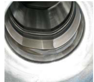
Left: Red-brown Rouge layer in WFI-tube system (material 316L)